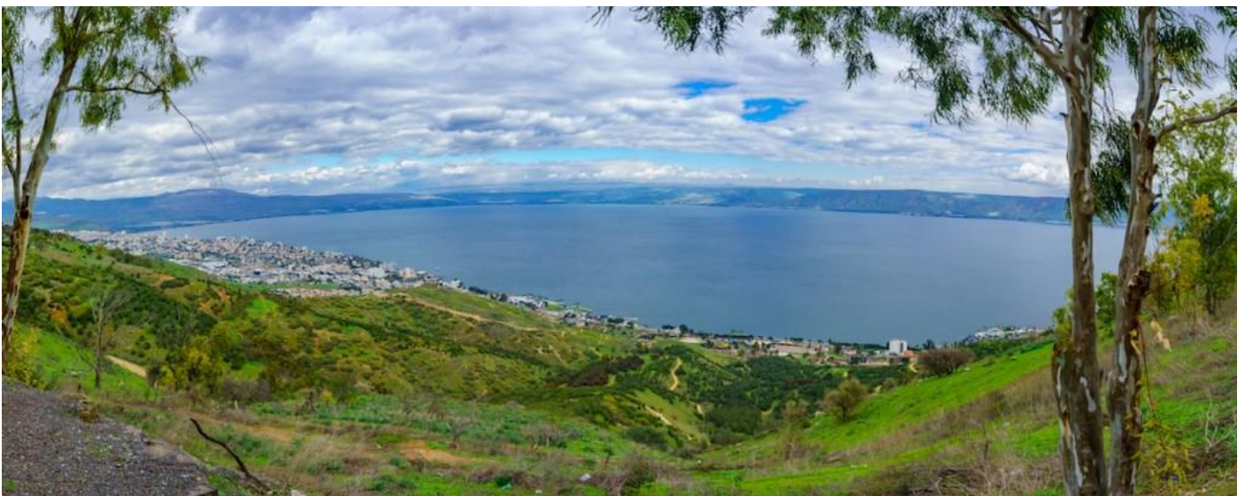
The Sea of Galilee